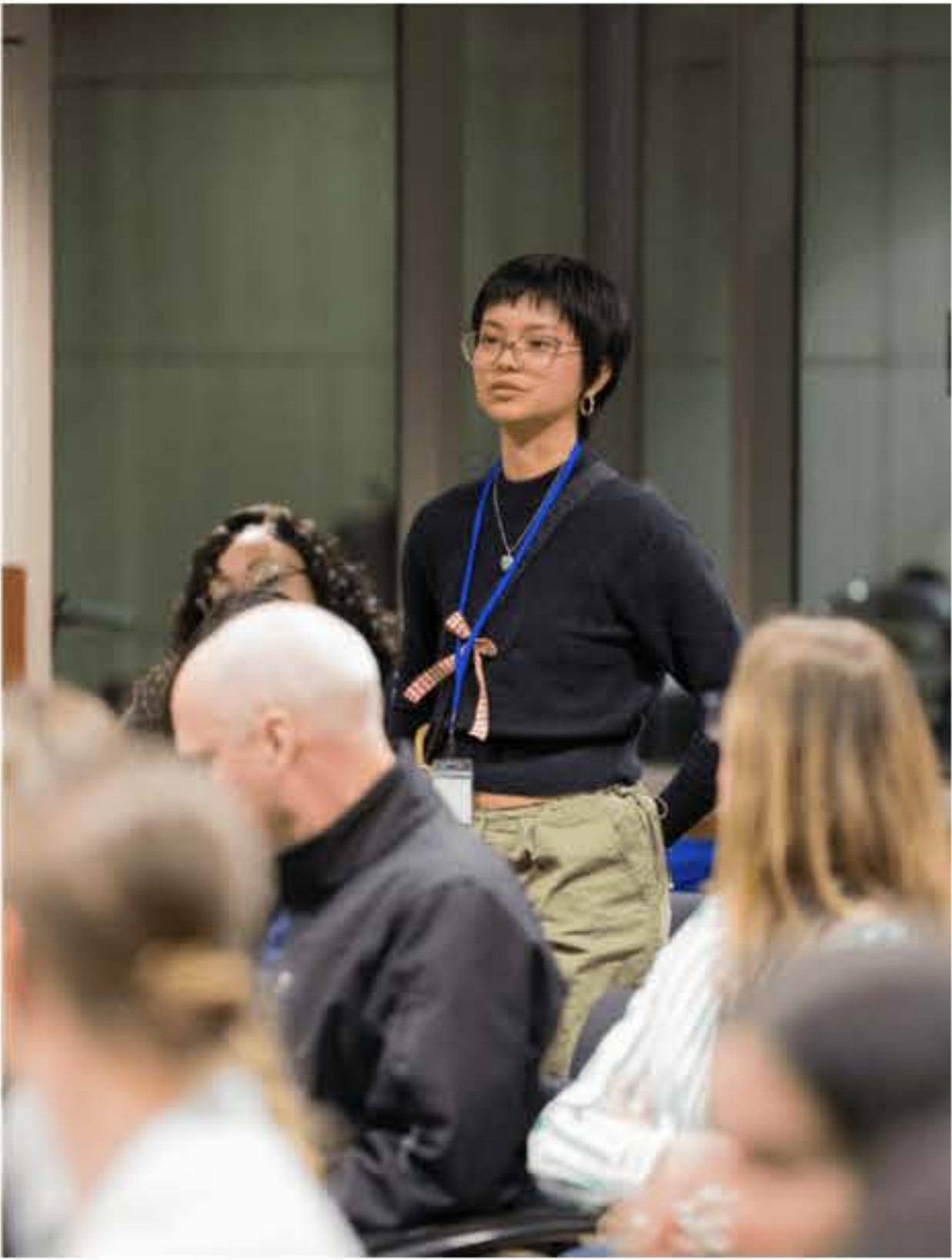
Attendees engage with the panelists during the Q&A session.

Everyone then made their way outside to enjoy meaningful one-on-one networking with each other and our speakers. The air was buzzing with exciting conversations sparked by the insights provided by the panel. In the midst of the reception, lots of fun was also had as the winners of our raffle prizes were announced.