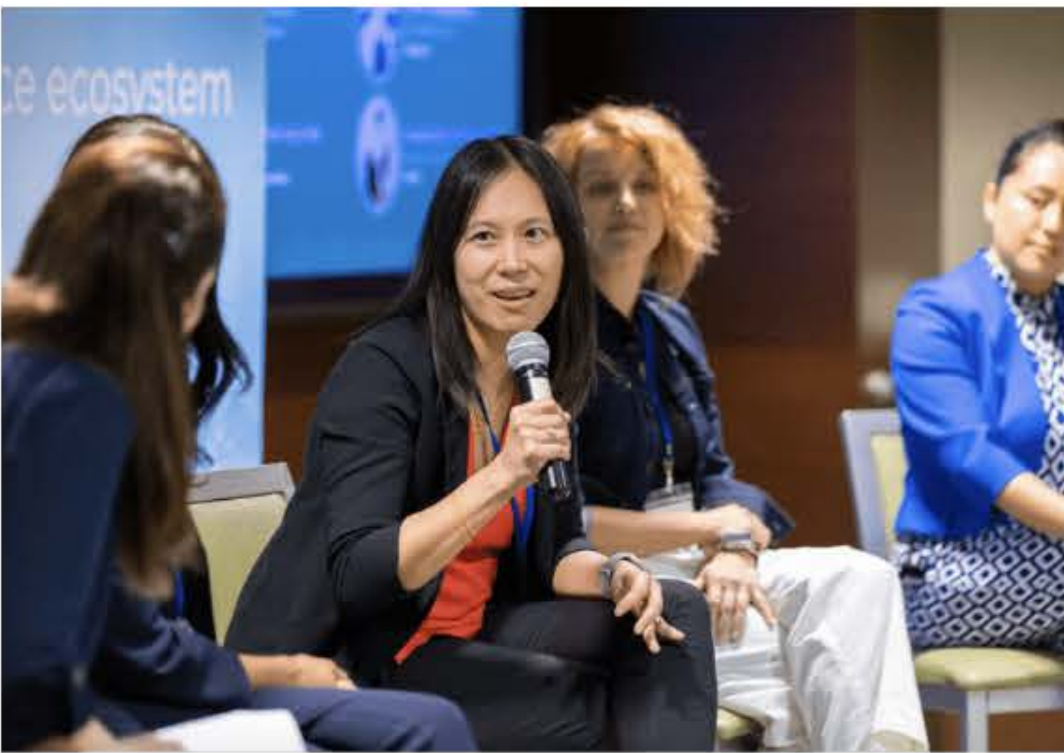
The guest speakers discuss their experiences in the climate tech and sustainability fields.

After the panel, the floor was opened up to the audience for questions. Students and working professionals alike were curious to learn even more. One student asked what inspires the speakers most in their current jobs. Many credited the collaborative, supportive environments of their coworkers and encouraged everyone to pursue and create similar teams. Another audience member talked with the speakers about how we can get everyone involved with empowering women, and another shared her own perspective on the challenges women face in being treated equally in the workplace.