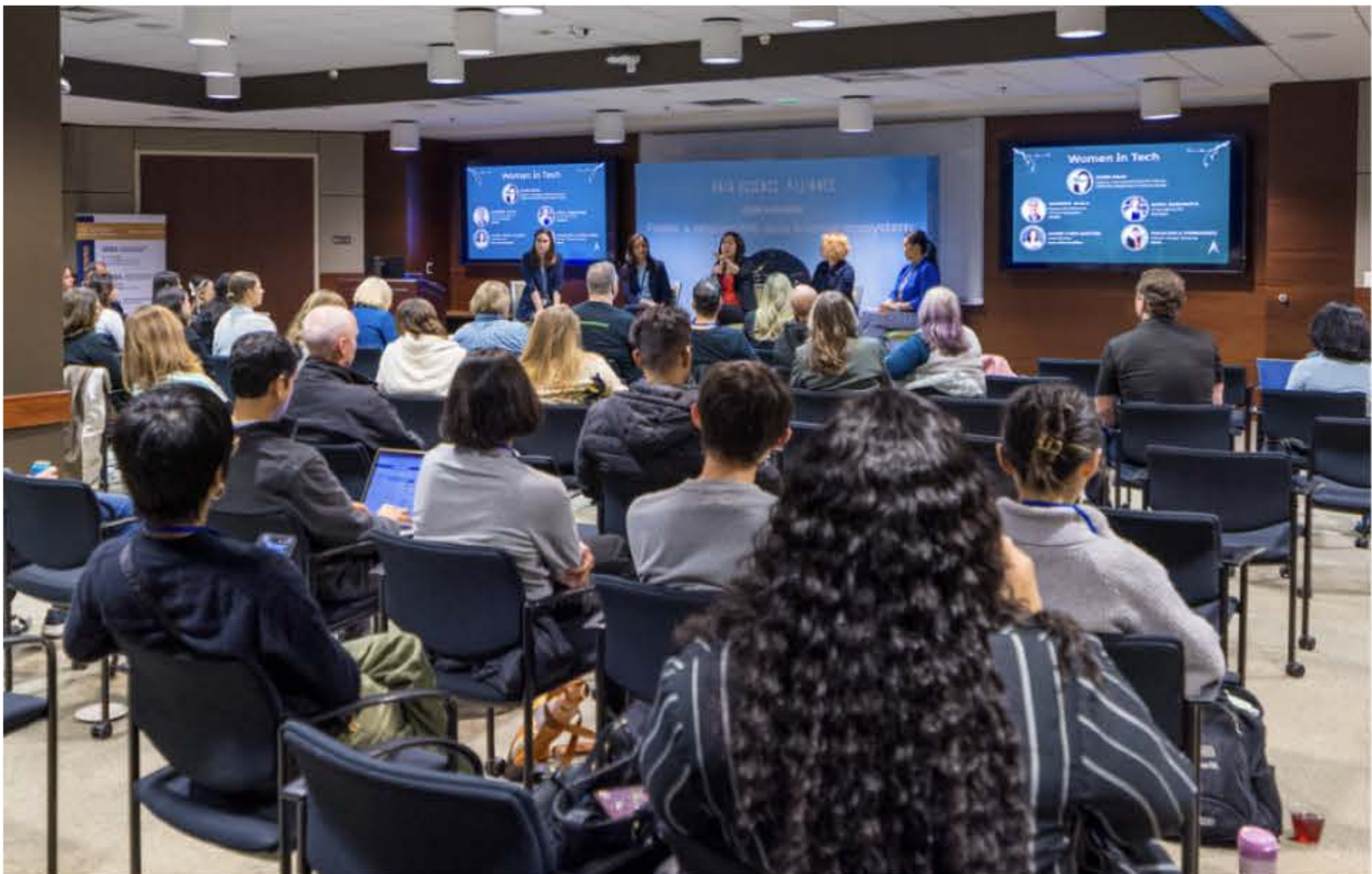
The audience listens as the guest speakers share their stories.

All of the raffles were donated by local businesses that are women-owned and/or are focused on promoting sustainability. It was a special moment of collaboration with our community as we worked together to promote the purpose of our annual Women in Tech event. The support DSA received this year was overwhelming and humbling—we are truly grateful for everyone's contributions to continuously building a Responsible Data Science ecosystem in San Diego and beyond.